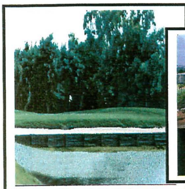
New Greens help make the Pines one of the South Florida's best kept secrets.