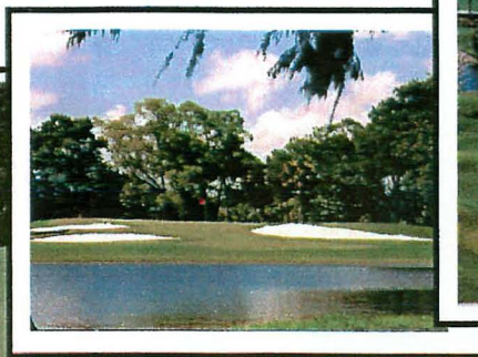
This splendid Fazio classic is currently rated as the 2nd most demanding course in South Florida.