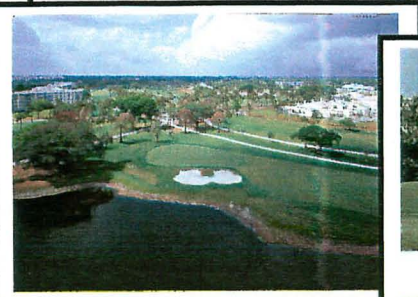
According to a recent Sun-Sentinel review, the Oaks is "... possibly the top course in Broward County."